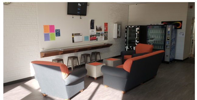
Furniture made for Cambridge High School's Student Lounge. Made in Shops 29 (Wood Shop @ OCC) and 16 (Sewing Shop @ OCC)

Congratulations NICE GOING! GREAT! Way to Go! Yea! FELICITATIONS CHEERS Take A BEST BOW! WISHES!