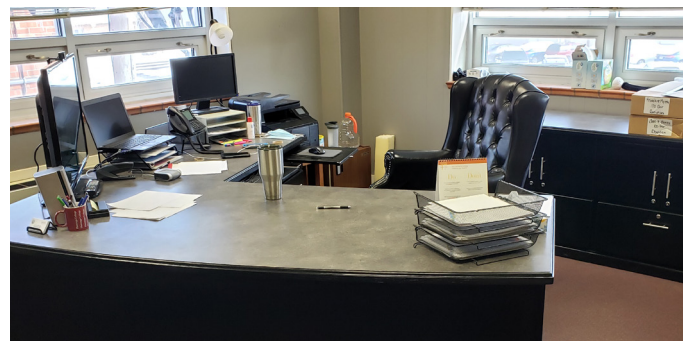
Right: Probation Office in Hastings. The Desk, Cabinet, and Hutch all made in Shop 29 (Wood Shop @ OCC)