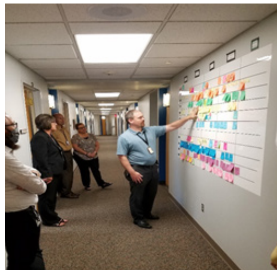
Above and Right: CSI Team members working with the NDCS Process Improvement team!