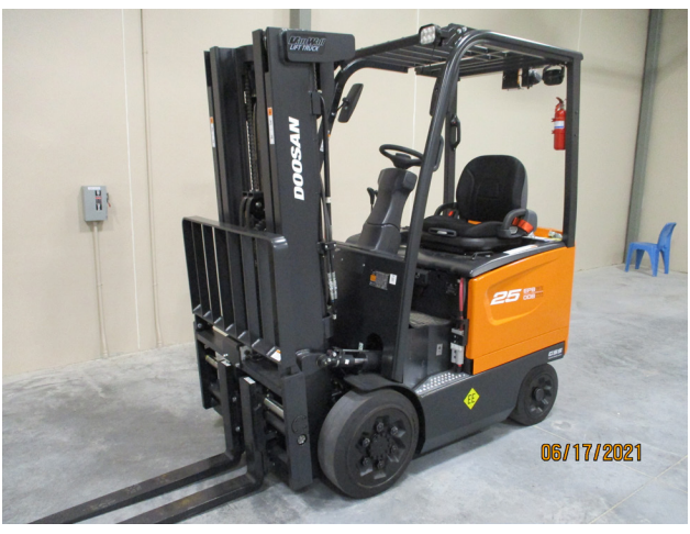
Above: Take a look at some of the new equipment at Shop 61 (Wood Shop @ TSCI). New spray pumps and guns in their stain room. A new HVAC unit for the stain room will help the quality of their finishes, and make it a safer environment for their workers. Also, a new forklift!