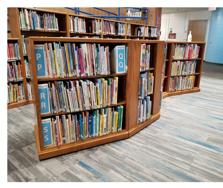
Custom bookcases made for Westmont Elementary School. Made in Shops 29 (Wood Shop @ OCC)