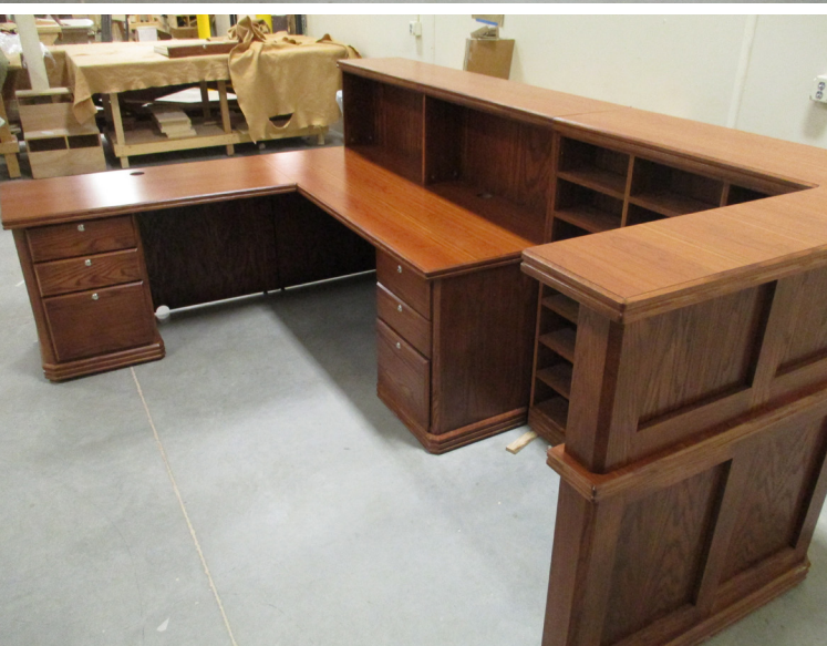
Above and Left: Pictures of a desk being built in Shop 61 (Wood Shop at TSCI). This desk is a circulation desk for the Holt County Courthouse.