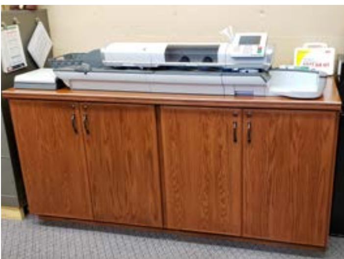
Items for the Cherry County Treasurer's Office - Made in Shop #39