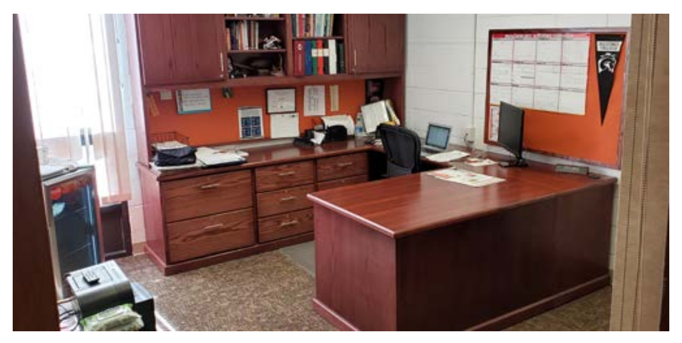
Ogallala High School Athletic Director Desk - Made in Shop #29