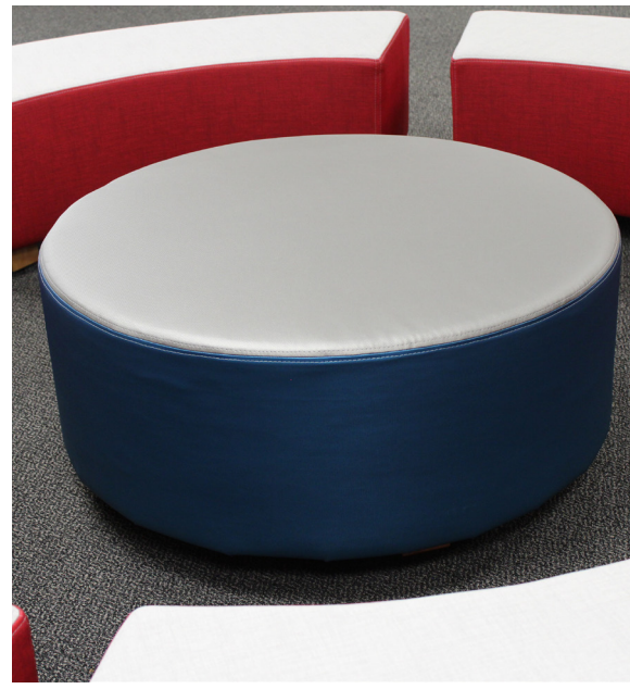
Ottomans for the CSI Showroom made in Shops 29 and 16