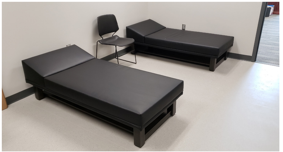
Table, Chairs, Desk, and Nurse's benches made in Shop 29 and 16