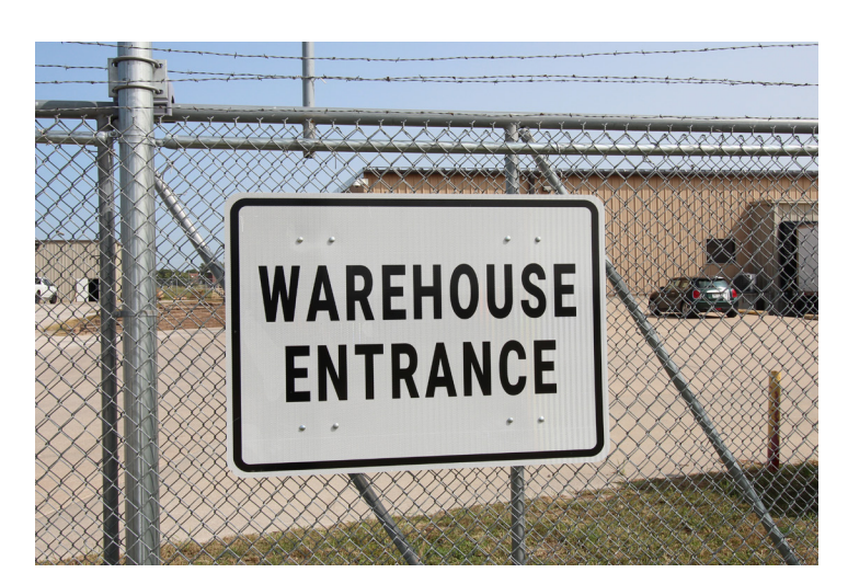
The signs were made by Shop 28.