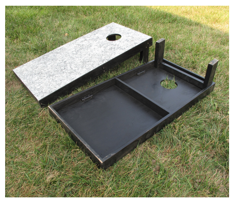
Cornhole Board Set made in Shop #29