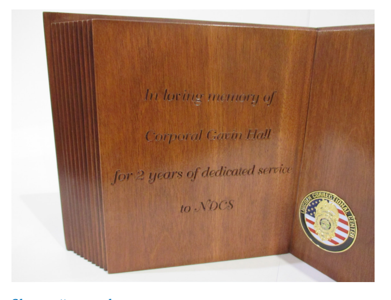
Memorial Plaques made in Shops #23 and 39