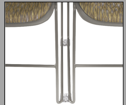
Ganging glides of durable steel or polycarbonate snap together to create evenly-spaced straight rows.