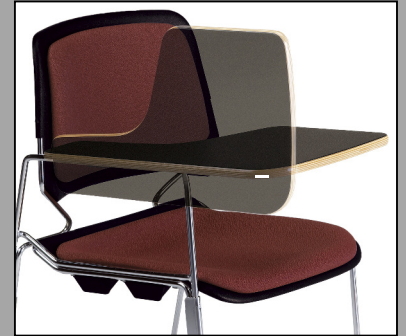
Field-installable tablet arms flip up to allow easy access to and from the seated position.