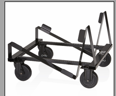
An MVP.BL dolly allows Fixed Seat and Back chairs to be stacked 16 high, while the MXD.BL dolly accommodates up to 45 Poly chairs.