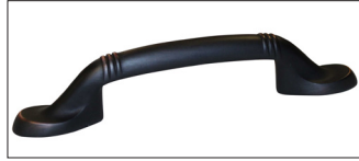
Oil Rubbed Bronze R-AC-495