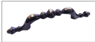
Antique English S-AC-367