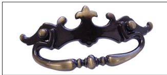
Antique English S-AC-365