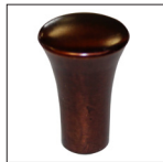
Venetian Bronze R-AC-505