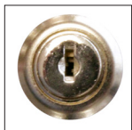
Bright Brass S-AC-383