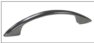
Polished Chrome R-AC-496