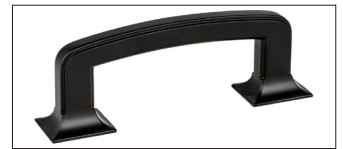
Matte Black S-AC-344