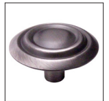
Antique Silver S-AC-510