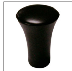
Oil Rubbed Bronze R-AC-508