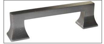
Nickel Satin R-AC-498