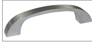
Brushed Chrome R-AC-497