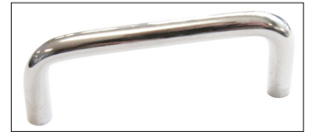
Chrome - S-AC-347 (pictured) Brushed Chrome - S-AC-345 Black - S-AC-351