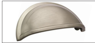
Satin Nickel Cup S-AC-398