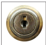
Antique Brass R-AC-357