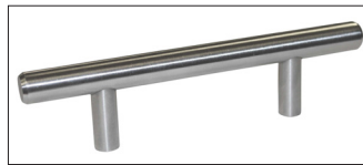
Stainless Steel R-AC-499