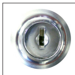
Bright Nickel S-AC-384