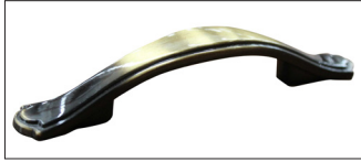
Antique Brass R-AC-351

800 Pioneers Blvd | Lincoln, NE 68502 Toll Free: 800-348-7537 | Website: csi.nebraska.gov Email: csi.salesandmarketing@nebraska.gov