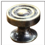
Antique Brass R-AC-503