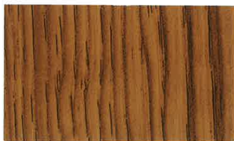
Cinnamon SW 3203