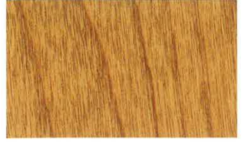
Gourmet Oak on Birch