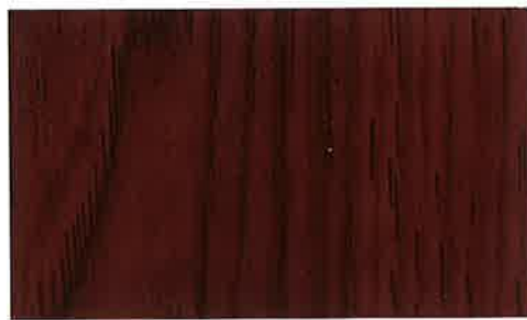
Cordovan SW 3226