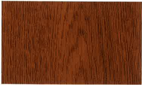
Library Oak SW 3216