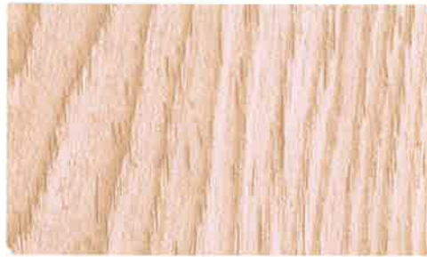
★ White Ash SW 3221