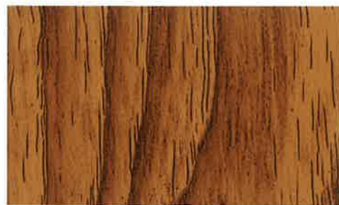
Fruitwood SW 3204