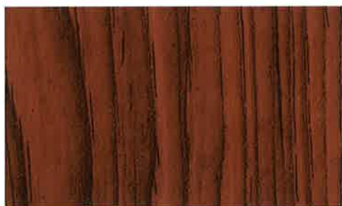
Mahogany SW 3213