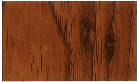
★ Chestnut SW 3211