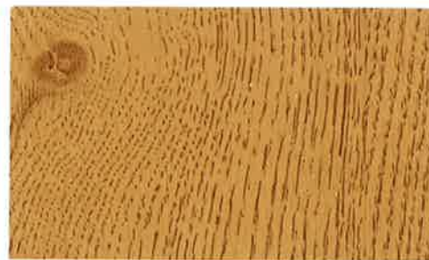
Wheat SW 3202