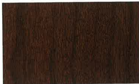
Bronze Walnut on Walnut