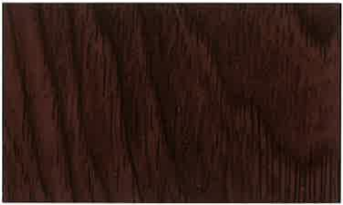
Black Cherry SW 3229