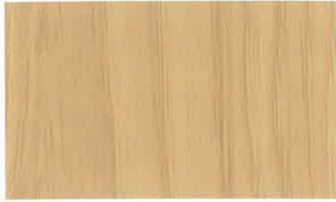
Basswood SW 3222