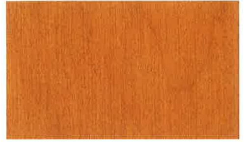
Sugar Maple on Maple