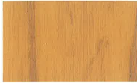
Butternut on Ash