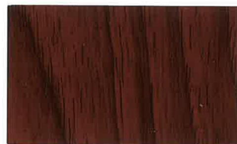
Sedona SW 3227