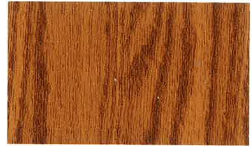
Scandia Teak SW 3209