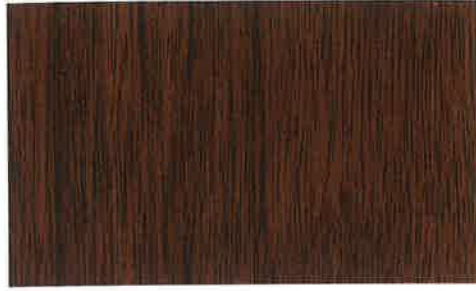
Mission Oak on Cherry