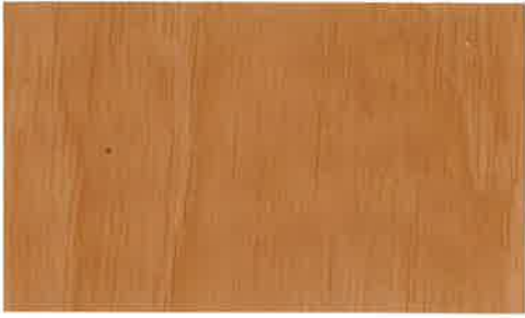
★ Clear SW 3201