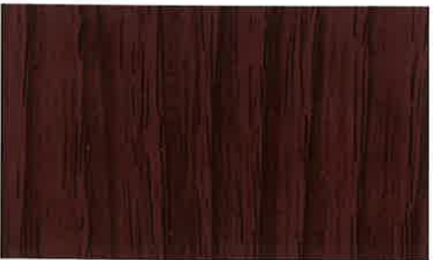
Dark Mahogany SW 3230