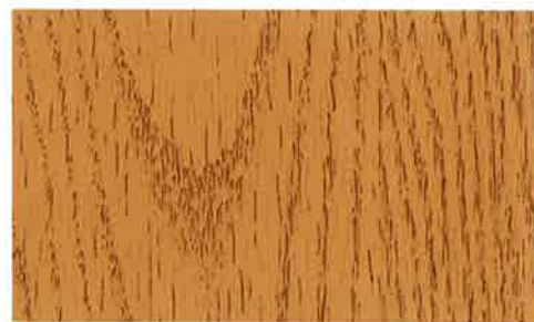
Autumn Oak SW 3205