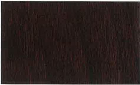
Blackberry on Cherry