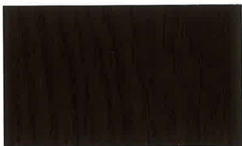
Black Walnut SW 3234