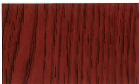
Washington Cherry SW 3228