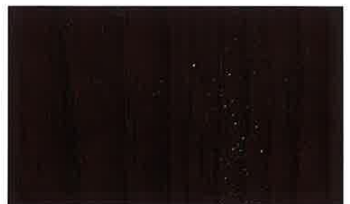
Blackberry SW 3231