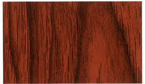
Auburn Anigre SW 3217