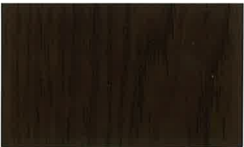
★ Ebony SW 3232