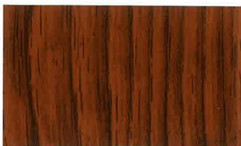
Golden Maple SW 3236