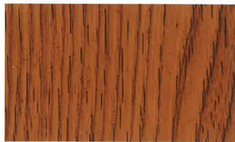
Cherry SW 3207