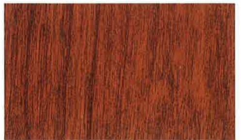
Colonial Cherry on Cherry