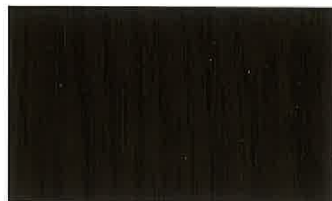
Midnight Black SW 3233