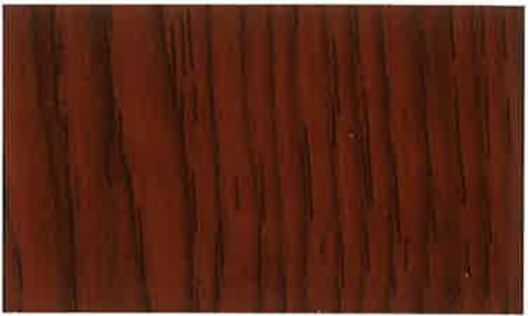
Traditional Cherry SW 3214