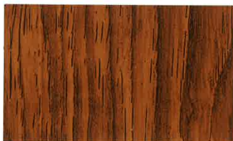
Golden Hickory SW 3206