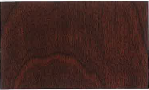
Sedona on Cherry