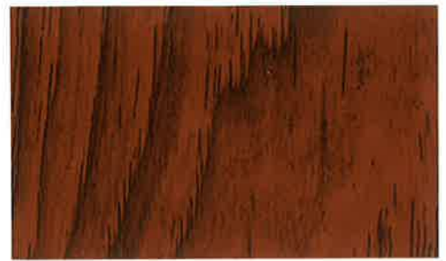
Classic Fruitwood SW 3215