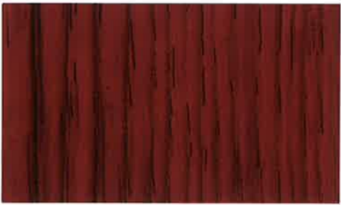
★ Deep Cherry SW 3225