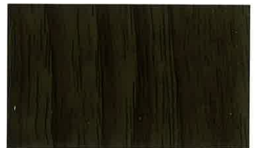
Hollyleaf SW 3235