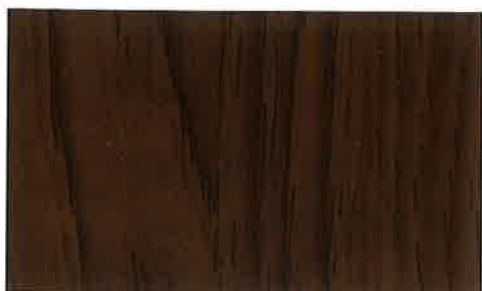
Mission Oak SW 3220